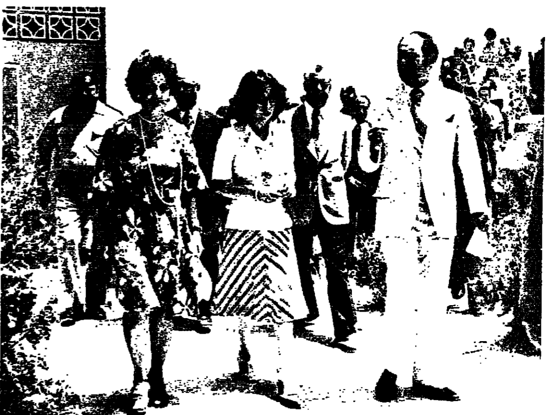
Her Highness Princess Basma listens to details of a summer camp for 50 orphans, which she opened at Amman Training Centre Tuesday.

* AMMAN. — His Majesty King Hussein Tuesday visited the General Army Headquarters where he met Commander-in-Chief of the Armed Forces Lt. Gen. Zaid Ibn Shaker. The King was accompanied by Prince Hassan, Prime Minister Mudar Badran and Chief of the Royal Court Sharif Abdul Hamid Sharaf.